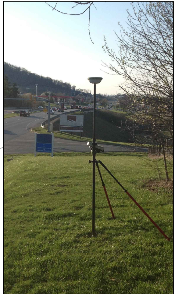
LOOKING WEST OF MONUMENT TOWARD INTERSECTION OF RTS. 1426 AND 250W

BASIS OF DATUM: HORIZONTAL: NAD83 (NA 2011), SPCS 4501 (VA N) VERTICAL: NAVD88, GEOID 12A STATIC GPS OBSERVATION WITH NGS OPUS SOLUTION; CHECKED TO EX. CITY CONTROL MONUMENTATION